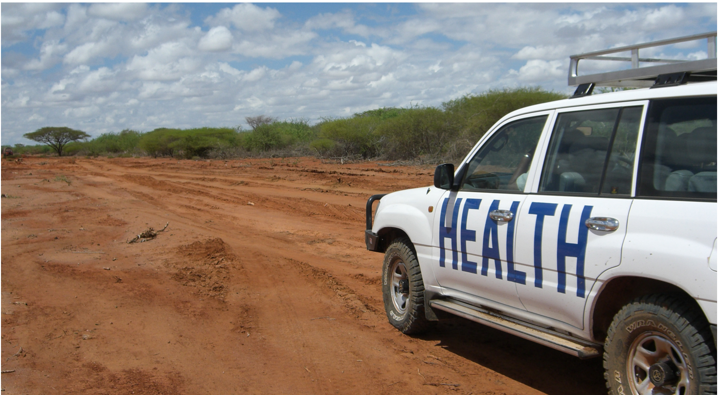
Project staff tackle the dusty roads and arid terrain of NEP en route to a health outpost.