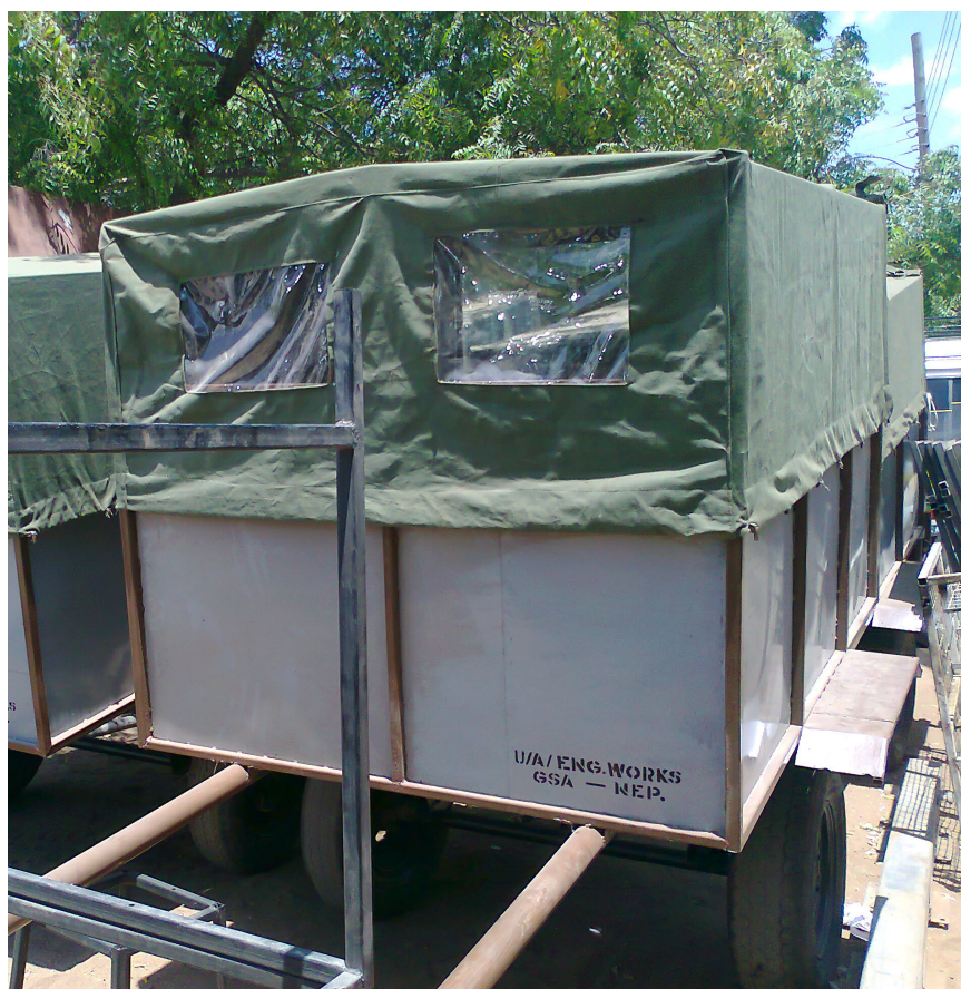
For the “Care for the Mother” activity, local craftsmen built donkey carts for women’s livelihood groups to use as emergency transport to health facilities.

In addition to supporting renovations and equipment for laboratory services, APHIA II NEP established a laboratory networking system that linked 20 laboratories for the transport of samples. This system primarily