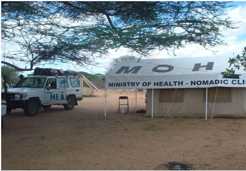
Nomadic clinics trail pastoralists across NEP, visiting markets and schools to treat illnesses, offer immunizations, and provide counseling on RH and HIV.