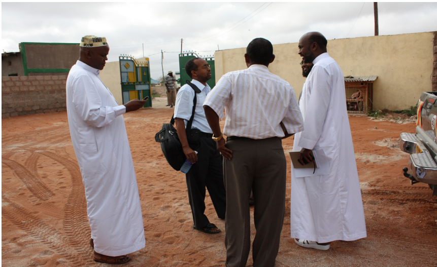
APHIA II supported three conferences where religious leaders discussed changing community attitudes around HIV, family planning, and birth spacing.

health topics to promote utilization of RH, FP, and HIV prevention and care services. The first conference of Muslim scholars in NEP was held in April of 2008 and yielded actionable, locally acceptable health-related resolutions. It proved so successful that a subsequent conference was held in February of 2010. Two additional conferences were also held for female Muslim scholars, the first in October of 2009 and the second in February of 2010. Overall, 134 male and 71 female religious leaders attended the conferences.