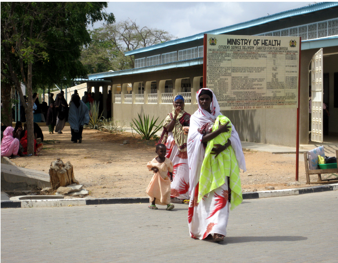
Women in the NEP capital city of Garissa have easier access to health facilities and providers than those living in its more remote regions.